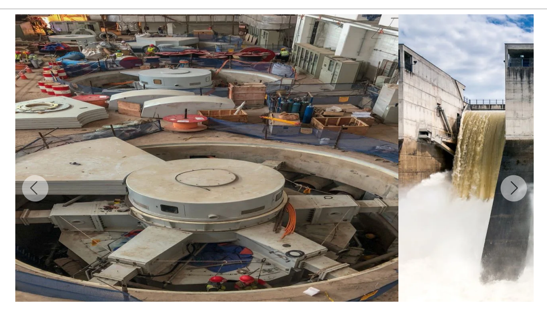
The Xe-Pian Xe-Namnoy hydroelectric power project is located in the southern region of The project includes the constr Lao\ People's\ Democratic\ Republic.\ Credit:\ wwwohmdotcom\ /\ Shutterstock. Namnoy Dam along the Mekons